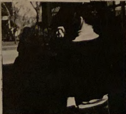
Love is blind.