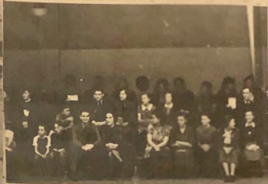
Just the same