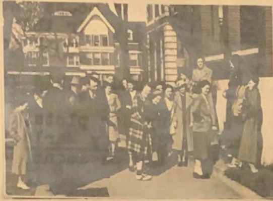
At the start of the day's tour.