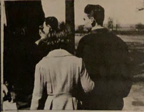
Love is an institution.