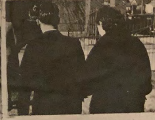
Love is a vital institution.